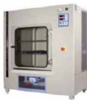
Corrosionbox 400 I