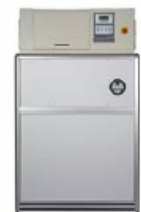
Solarbox 3000 RH

We reserve the right to make changes to equipment and systems in response to advances in technology and modify parameter values accordingly.