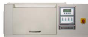
Solarbox 3000 e