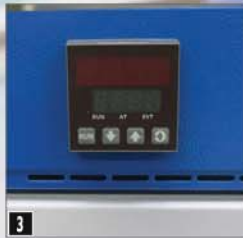
3 Cycles profiler 4 prog. 16 segments