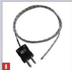
8 Thermocouple J sensor