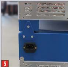
5 Stacking kit