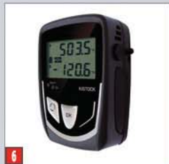
6 Paperless recorder 2 channels