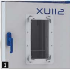
1 Door with viewing window