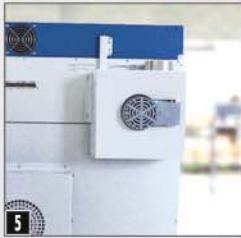
5 Air outlet extractor