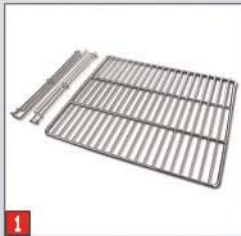
1 Shelf with guide bars