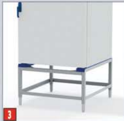
3 Fixed sub-frame