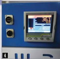
4 Profiler+digital recorder 4 channels