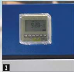
2 Digital weekly program timer