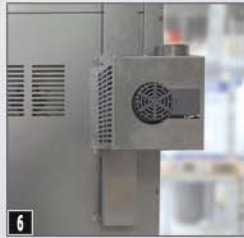
6 Air cooling extractor