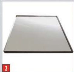
2 Recovery tray