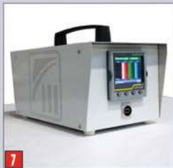
7 Portable paperless recorder with graphic screen 4 or 6 channels