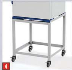
4 Sub-frame with casters