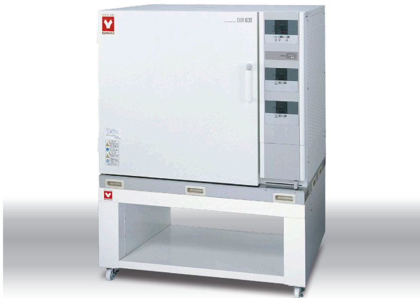
216L DIR631 (Stand : standard)